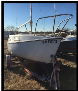
1978 San Juan 21 Please Call 940-704-5320