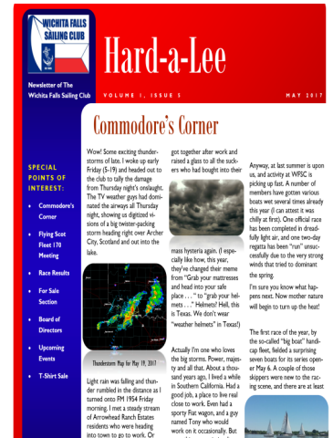
Older version of Hard-a-Lee

past year and looking forward to doing more great things in 2018. If anyone has any suggestions or recommendations, please let me know so we can try to make the WFSC a better place for all to enjoy.