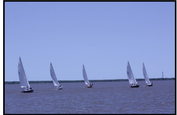
Flying Scot 170 Race Season, June 2017

In 2018, also there will be a written rules and situation quiz provided by U.S. Sailing for all attending. Could be very eye opening and fun .