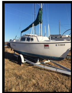
1971 Catalina 22 Please Call 940-704-5320