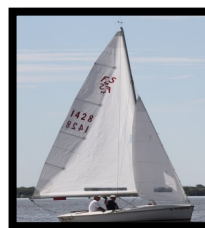
Flying Scot with 2 Sets of Sails (1 New & 1 Good) Please Call 940-733-4037