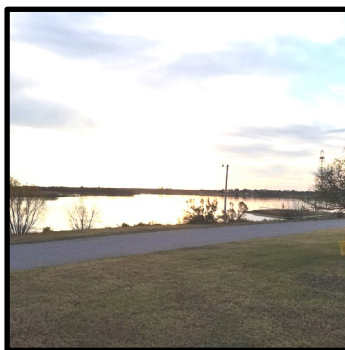
Boat Ramp at Sunrise, Oct 2017

http://www.sailingscuttlebutt.com/2017/12/12/erosion-fair-sailing-club-level/