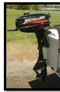
Mercury 3.3 HP Please Call 940-232-1437