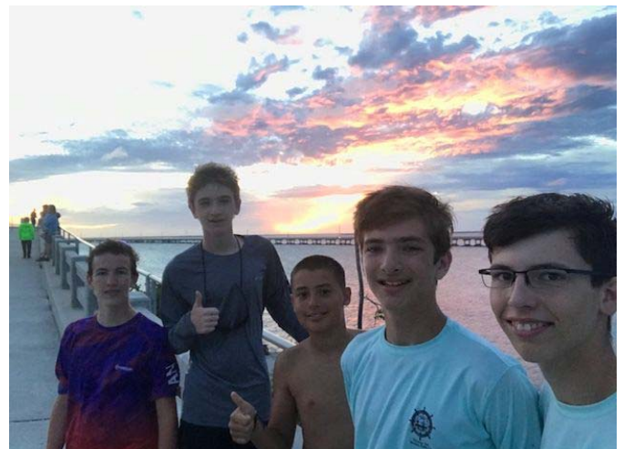
The gang poses before a South Florida sunset (or is it a sunrise?)