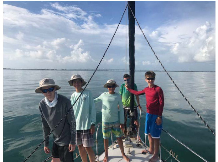
Is there a keel-hauling being planned here?