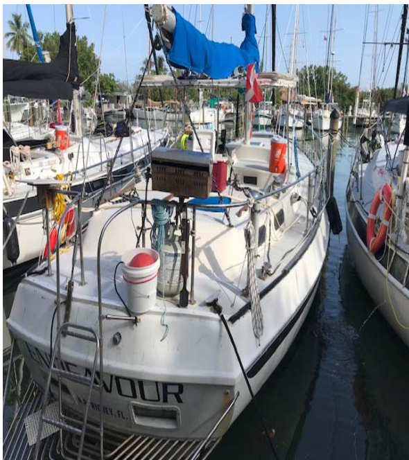
The Florida Boat . . . The BIG Boat!