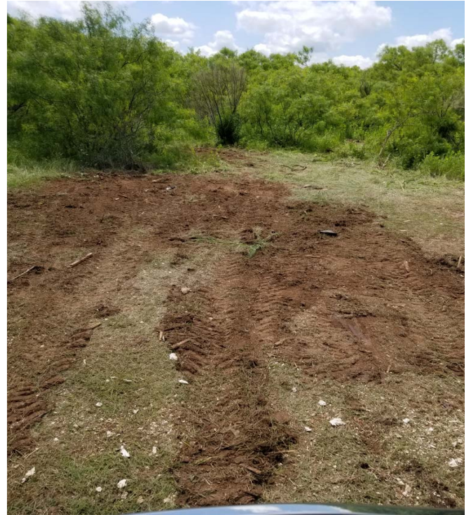
Clean as a whistle!

On a related note , if you have a boat/trailer, or an empty trailer, parked at the Club, it's your responsibility to mow around it. Stuff grows fast out there!